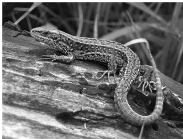
Fig. 1. Adult male of the species Zootoca vivipara (European common lizard) at an outdoor enclosure in the CEREEP, France (48°17'N, 2°41'E).

To circumvent these previous limitations of foraging ecology studies, it is important to conduct experiments in natural conditions to obtain realistic estimates that capture the effects of body size, density and climate conditions on the foraging success of diverse species. This study achieves this important goal by investigating natural feeding rates of the European common lizard Zootoca vivipara Jacquin (Fig. 1) in outdoor enclosures. Z. vivipara is a small ovoviviparous lizard that preys opportunistically on diverse invertebrate species (Avery 1966; see also Appendix S1, Supporting Information). Our goals were to: (i) gain an understanding of the factors influencing prey consumption in Z. vivipara by using a comprehensive approach that incorporates individual, population and environmental effects; (ii) identify the most parsimonious feeding rate function considering diverse allometric and density-dependent functions; and (iii) investi-